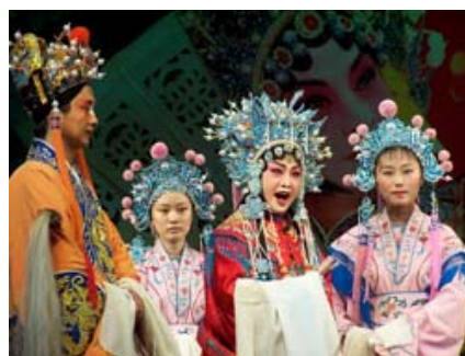
Actor on the Stage