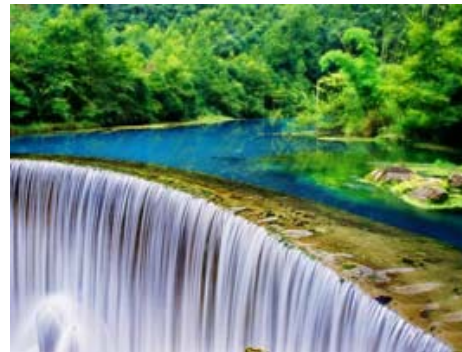
Shangri-La of Yunnan