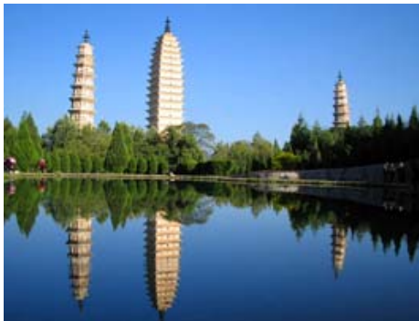
Lijiang City of Yunnan

British writer James Hilton's novel, The Lost Horizon, some 50 years ago, described in great detail the stunning scenery in Shangri-La: the azure sky, the breathtaking beauty and the hospitality of unsophisticated people who welcome weary travelers to their homeland. In Tibetan, Shangri- La means a place of good fortune and luck.