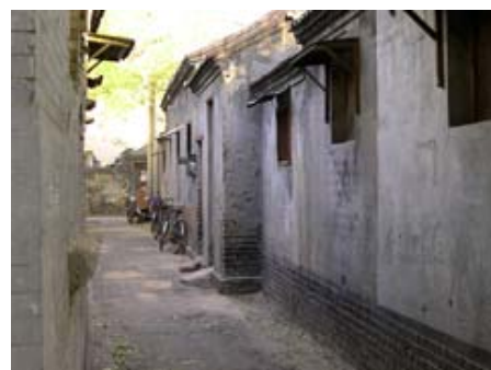
Siheyuan in Beijing