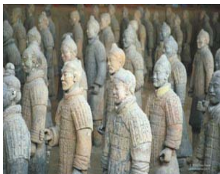
The Terracotta Warriors

Xi'an has been the capital of eleven dynasties for more than 2000 years. Along with Rome and Constantinople, this city played a vital role in bridging the gap between east and west. There are important sites and relics in this city. The Terracotta Army of Qin Emperor is regarded as the eighth wonder of the world. The Tomb of Yang Yuhuan and Huaqing Pool all date back to Tang Dynasty, the peak of China's federal period. Famen Temple in Xi'an is the only temple in mainland China storing true relics of Buddha Sykyamuni.