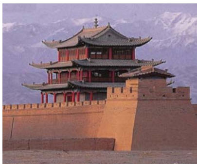
Ancient City of Dunhuang

Throughout Dunhuang's history of over two thousand years, it has always served as a critical gateway to the west because of its unique geographical location at the juncture of Gansu, Qinghai and Xinjiang. However, Dunhuang was also a regional cultural center. The Mogao Grottoes, also known as the Dunhuang Grottoes or the "Thousand Buddha Grottoes", is located on the western cliffs of the Singing Sands Mountains. It is one of the most complete collections of Buddhist frescoes and sculpture from a period ranging over ten dynasties.