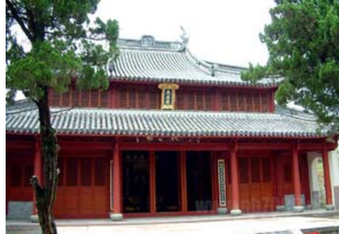
The Confucius Temple

Recommended sites of accompanying person tour might include,