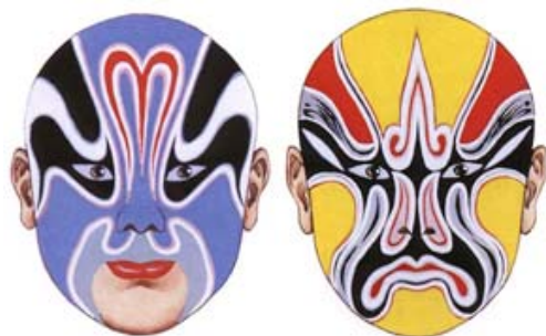
Mask of Peking Opera

Among all traditional Chinese operas, Peking Opera is a relatively newcomer. However, it has become the important and influential opera form for Chinese audiences and is now regarded as a nationally accepted form.