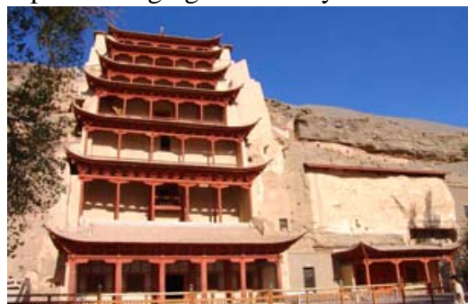
Temple of Sleeping Buddha